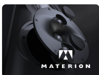
DPC-Array Directivity pattern control *USA Patent pending