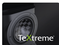
TPCD Thin Ply Carbon Diaphragms