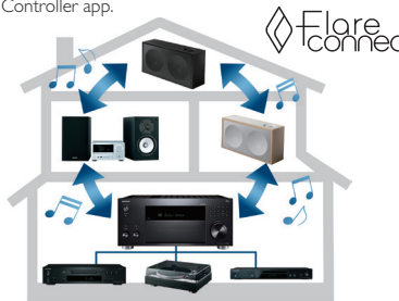
r external input availability visit <a href="http://www.onkyo.com/flareconnect.">http://www.onkyo.com/flareconnect.</a> Id Onkyo Controller free from the App Store or the Google Play Store

FlareConnect shares audio from network and external audio input sources between compatible components. Enjoy effortless multi-room playback of LP records, CDs, network music services, and more with supported components and speaker systems. Music selection, speaker grouping, and playback management across the home are built into the Onkyo Controller app.