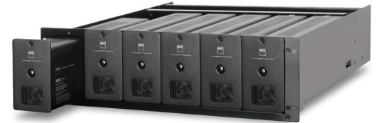
Six CI 720 mounted in RM720 rack (optional accessory)

The 60-watt per channel, single-zone CI 720 V2 Network Stereo Zone Amplifier with HybridDigital™ amplification technology is the perfect addition to today's most advanced custom home audio systems. Featuring 60 watts per channel, and powered by BluOS™, the advanced music management operating system, the CI 720 V2 allows you to access and stream 24-bit high-res music with the control of a smartphone or tablet via Ethernet and third-party control systems like Control4, Crestron, RTI and URC. The CI 720 V2 is now more flexible than ever with AirPlay 2 built-in for easy integration into the Apple ecosystem.