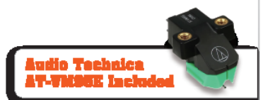
Audio Technica AT-VM95E Included